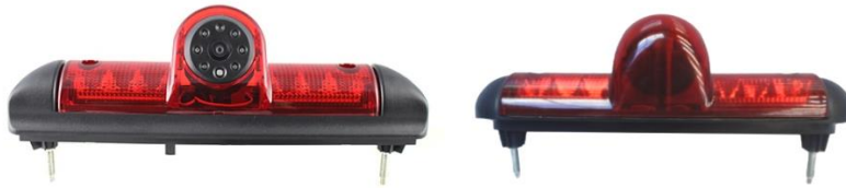
Brake Light Van Camera